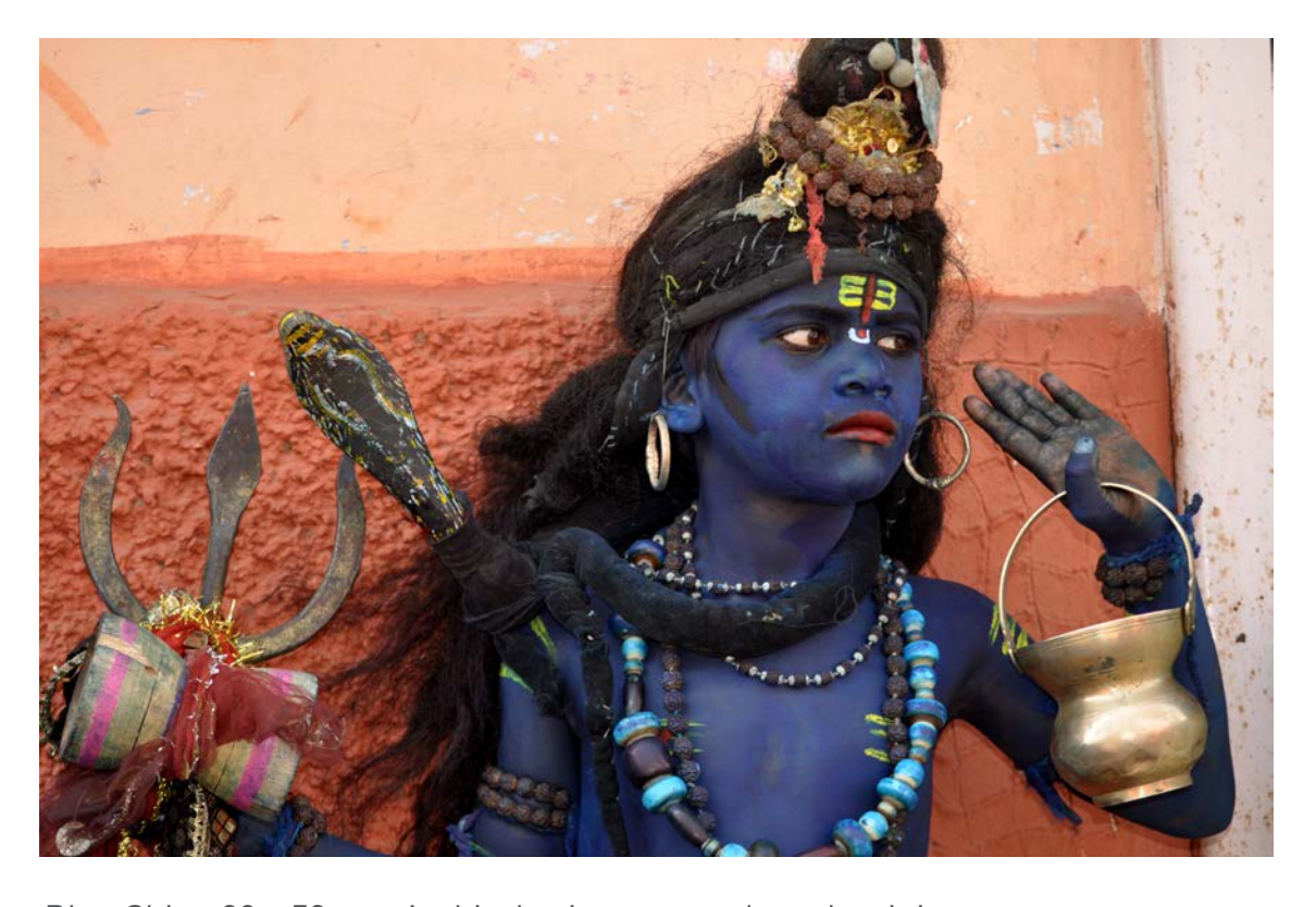
Blue Shiva, 80 x 53 cm. Archival print mounted on aluminium