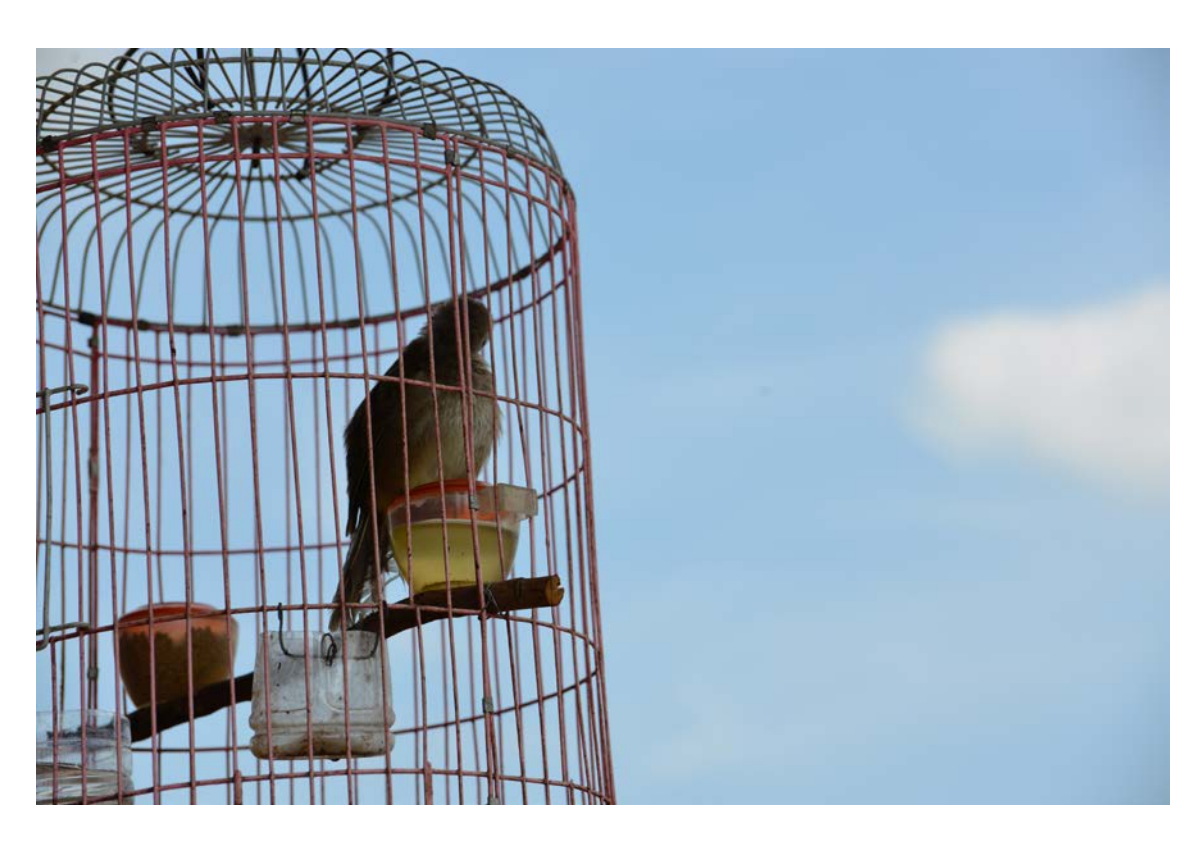
Freedom, 80 x 80 cm. Archival print mounted on aluminium