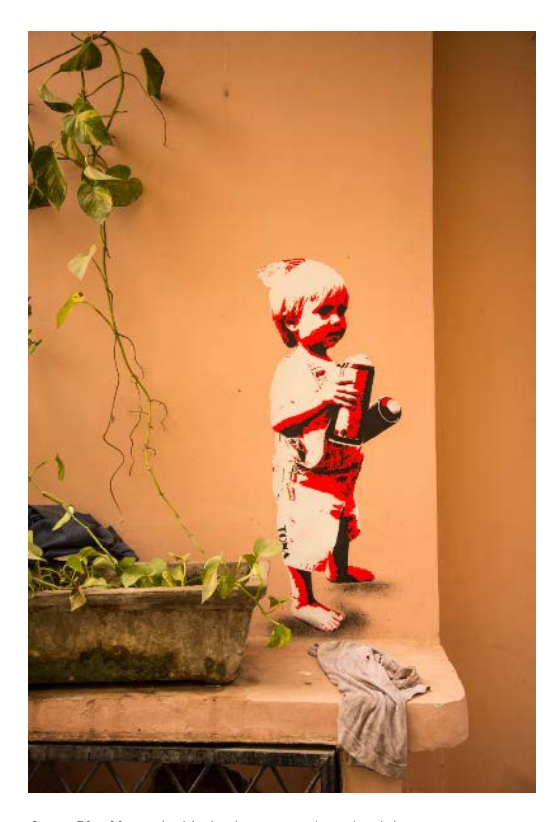
Spray, 50 x 80 cm. Archival print mounted on aluminium