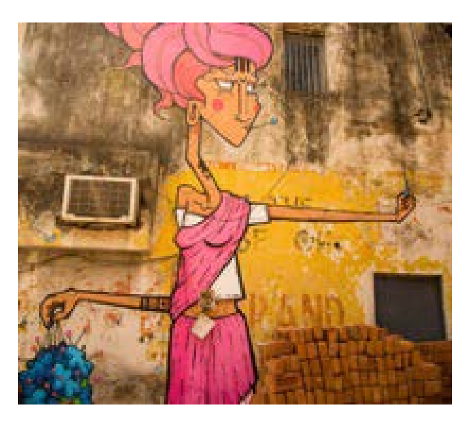
Bricks and black magic, 80 x 80 cm. Archivial print, mounted on aluminium