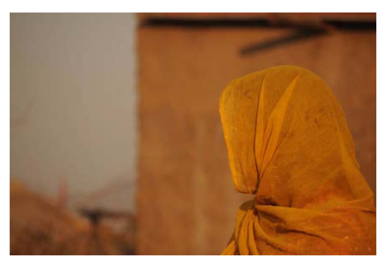
Woman in yellow, 50 x 33 cm. Enhanced mat paper