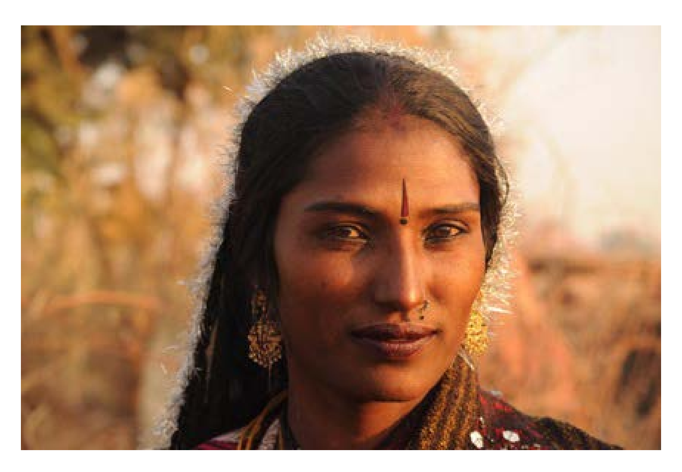
A gipsy princess, 50 x 33 cm. Enhanced mat paper