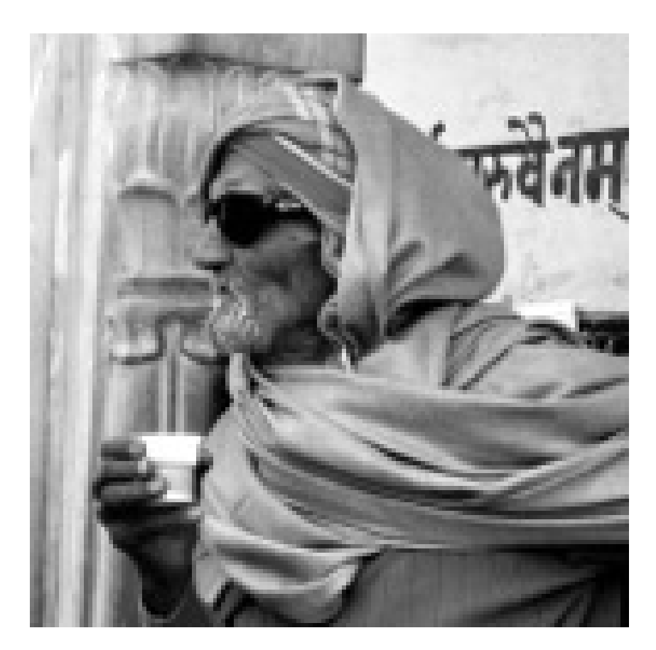
Cool guy, 50 \times 33 \text{ cm} . Archival print mounted on aluminium