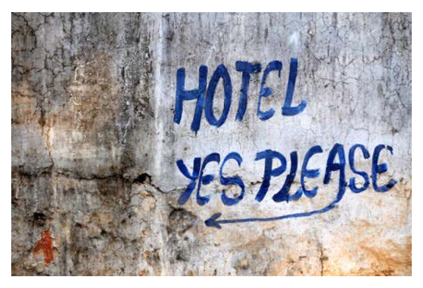
Hotel Yes please, 80 x 53 cm. Archival print mounted on aluminium