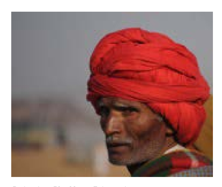
Red turban, 50 x 33 cm. Enhanced mat paper