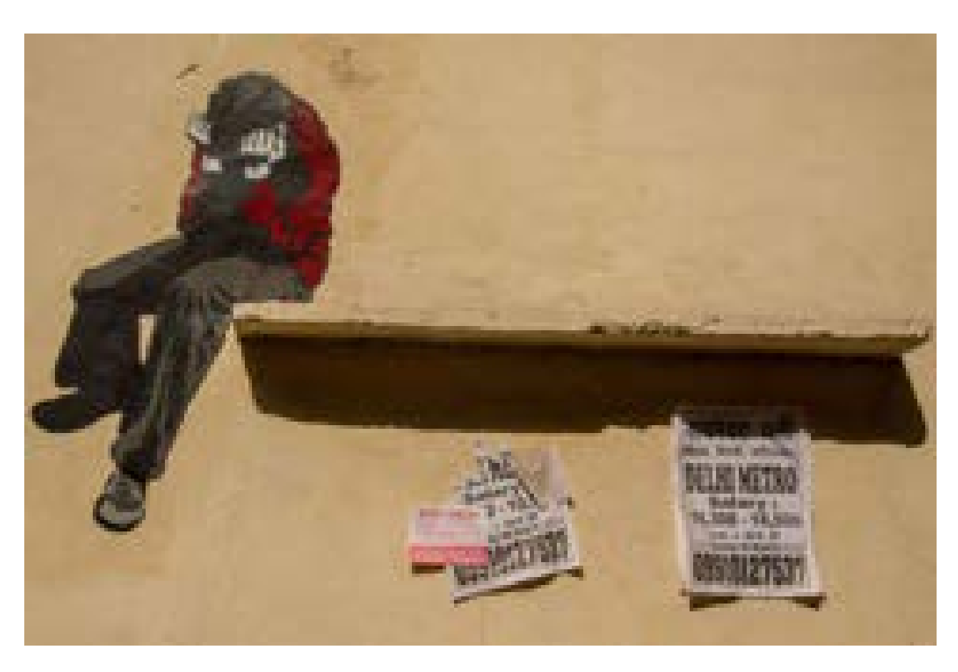
Desperado, 80 x 53 cm. Archival print mounted on aluminium