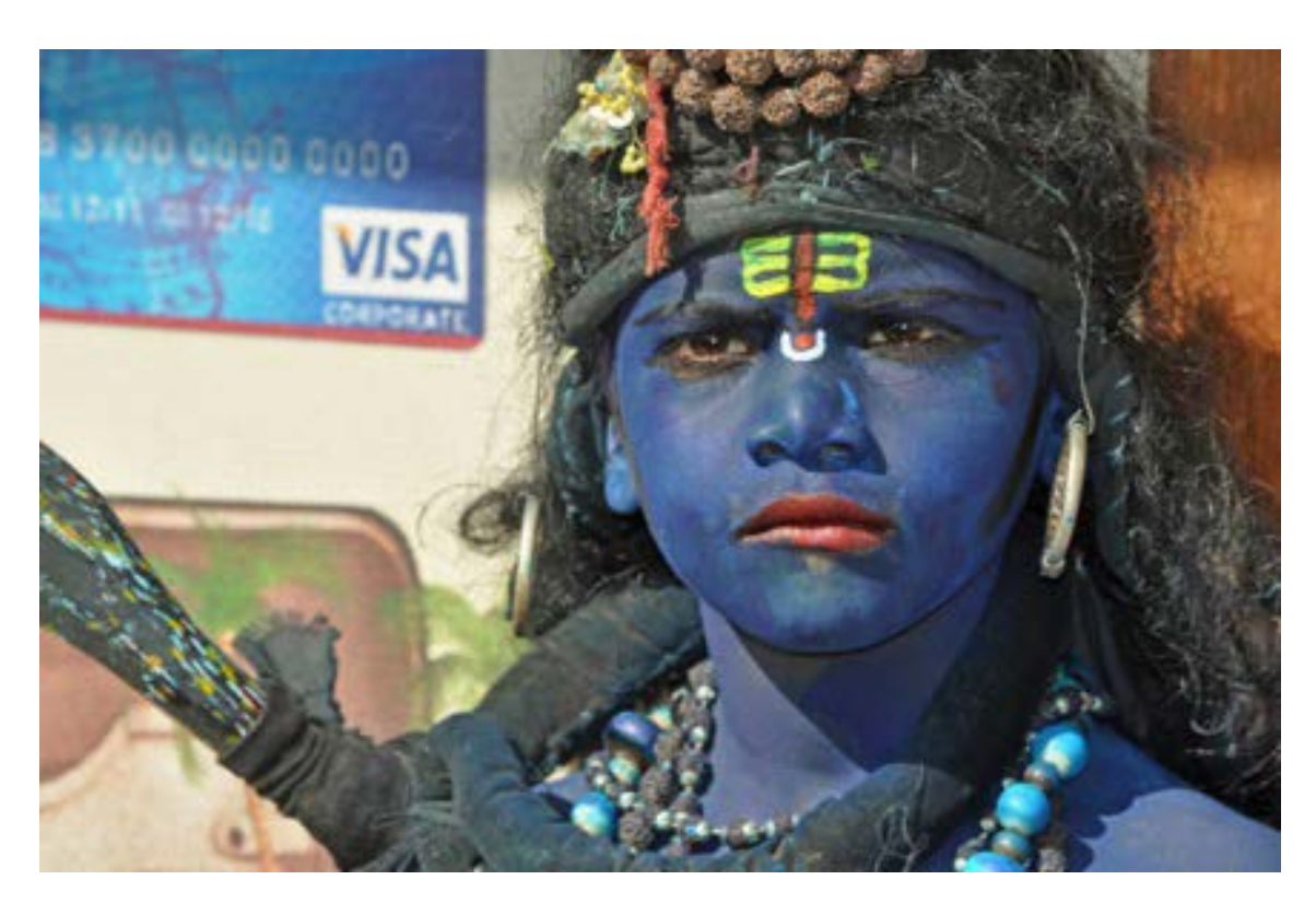
Blue Shiva and Visa, 80 \times 53 cm. Archival print mounted on aluminium