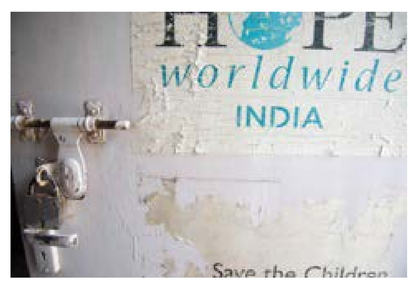
Hope, 80 x 53 cm. Archival print mounted on aluminium