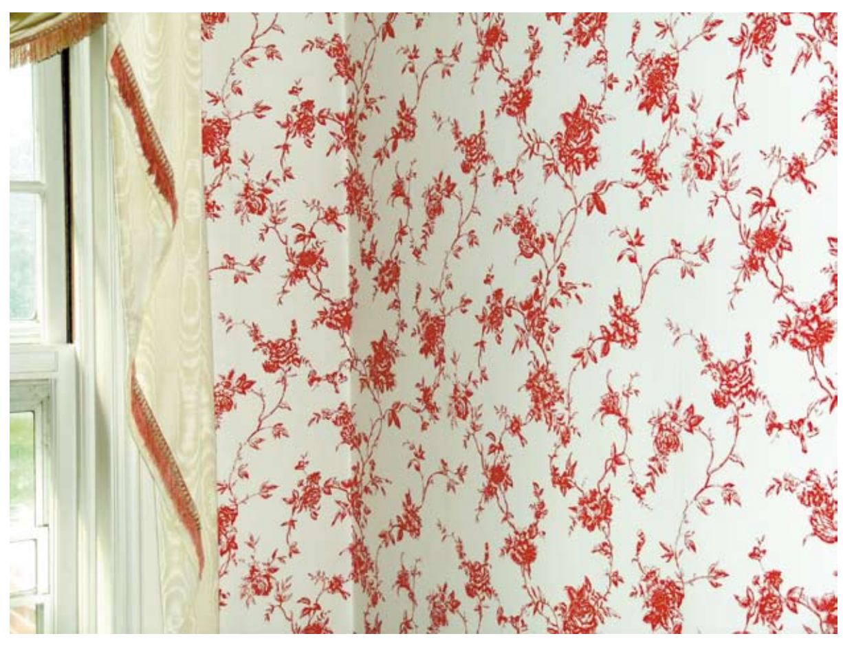
campus, lake forest