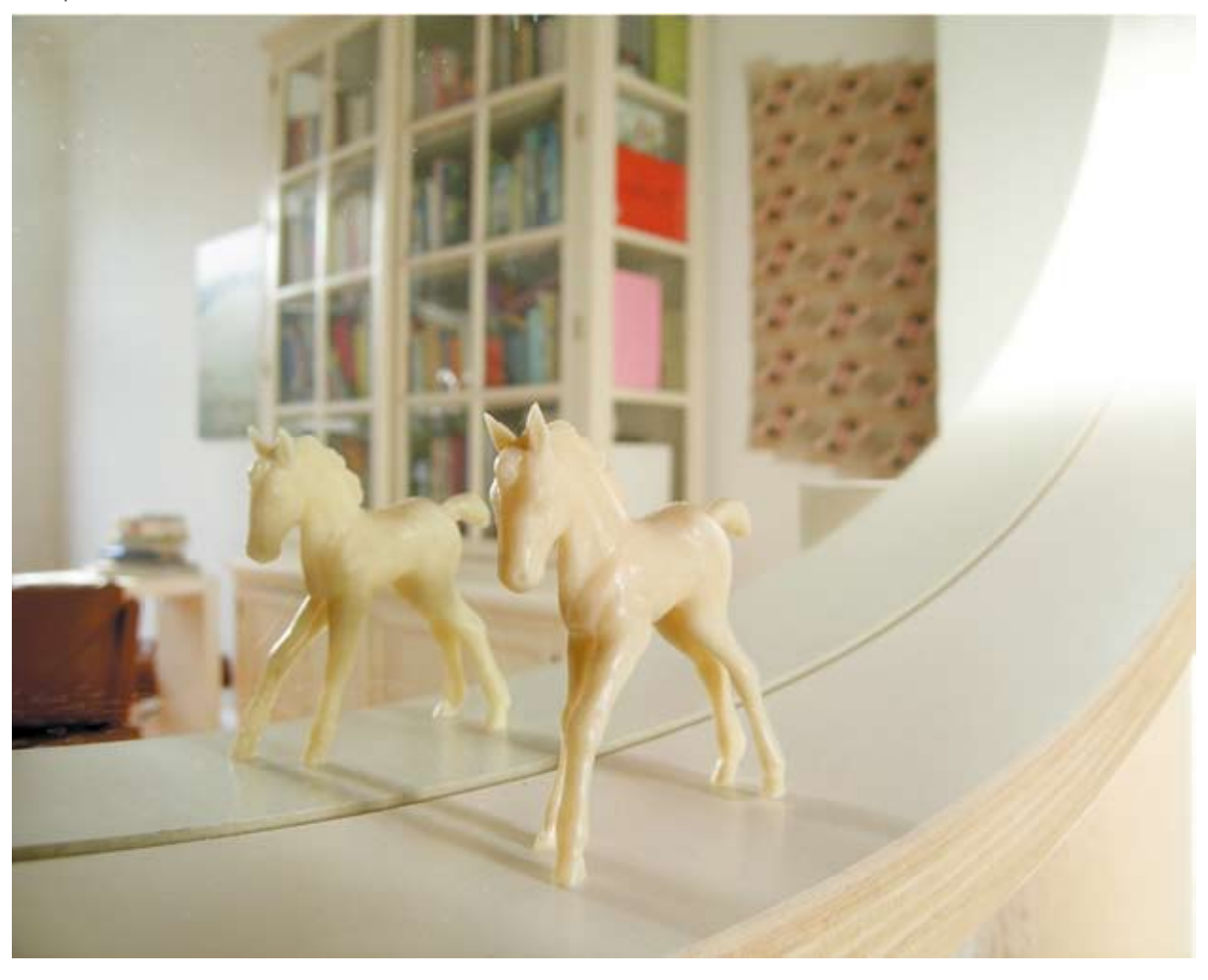
böckhstrasse I, berlin