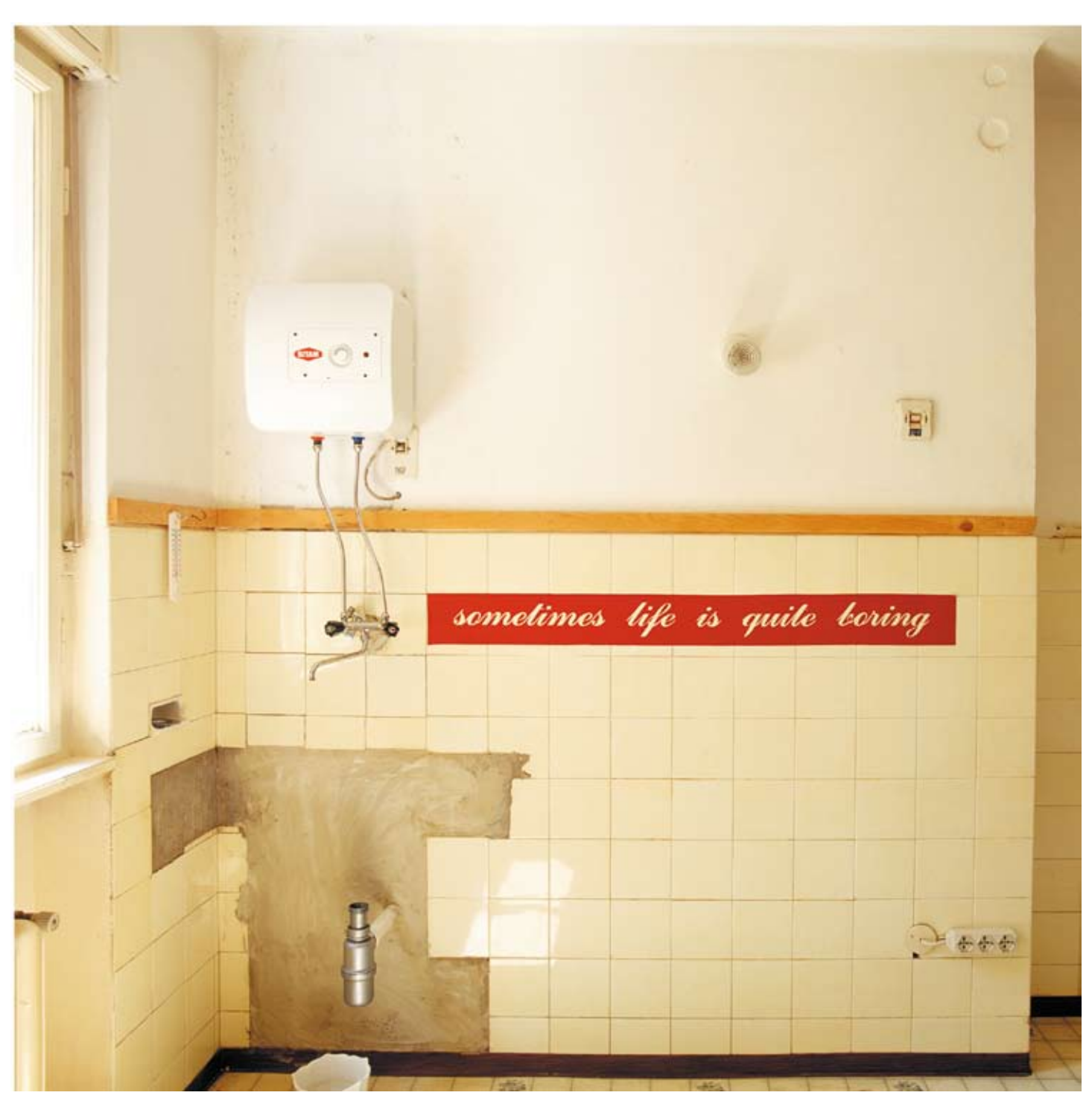
sometimes life is quite boring