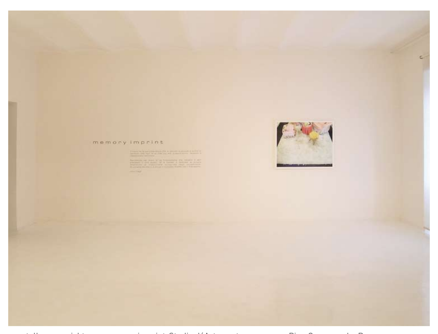
ausstellungsansicht aus memory imprint , Studio d´Arte contemporeanea Pino Casagrande, Roma