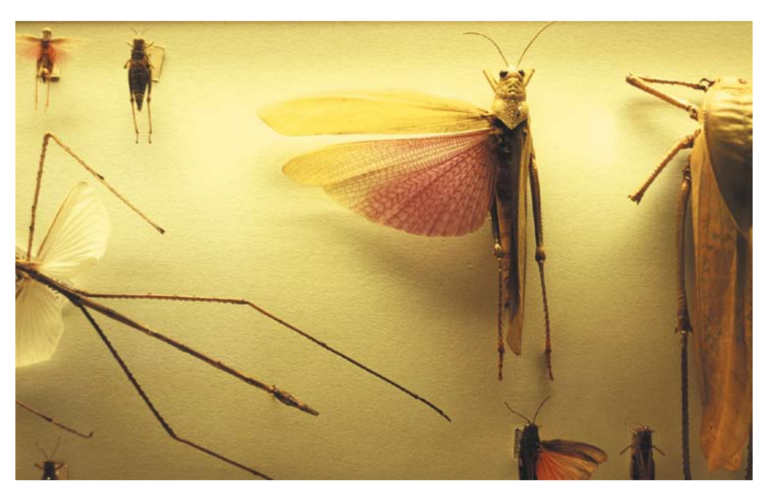
museum f ü r naturkunde